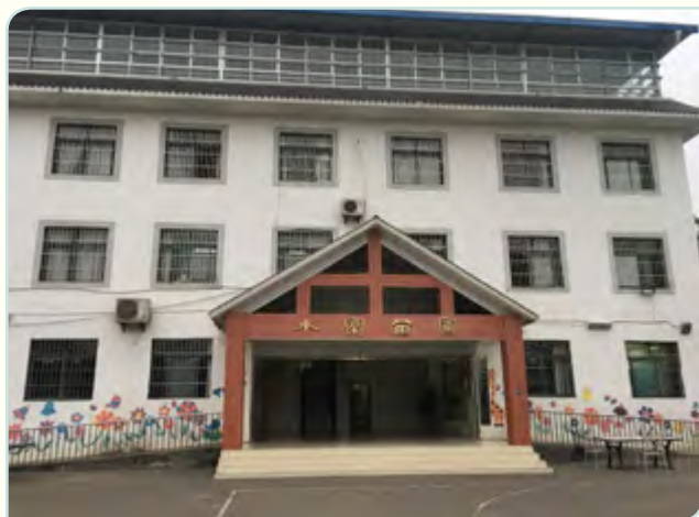
Shuifu Sowers Children's Home

The home is the first of its kind – Government built and NGO operated – taken up by Sowers Action. It provides care for children suffering from poverty and hardships in Shuifu of Yunnan. After five years' of operation, the Children's Home is well-instituted in its daily routine and management and is recognized and supported by local authorities. Currently, the home houses 87 children with 25 staff members. Works are in progress to build a new multi-purpose building in 2018-2019 and this will enable us to take in 30 more needy children.