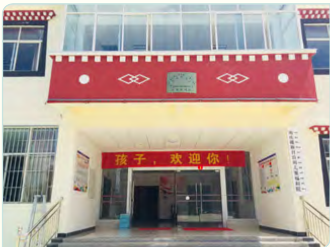
Diqing Sowers Children's Home

Located in the suburb of Yangon, Fullmoon Children's Home provides care for more than 300 children from 14 ethnic minorities groups. The Home's vision is to nurture the physical, mental and spiritual development of these children, equip and encourage them to return to their home-grown communities, including post-conflict settlements, and help support the development of these communities. Sowers Action had visited the Home in August 2017 and began subsidizing part of its operation costs from December 2017. To provide a better living and study environment for the children, Sowers Action also paid to repair and maintain the Home's ceiling and roof as well as the construction of a new basketball court cover.